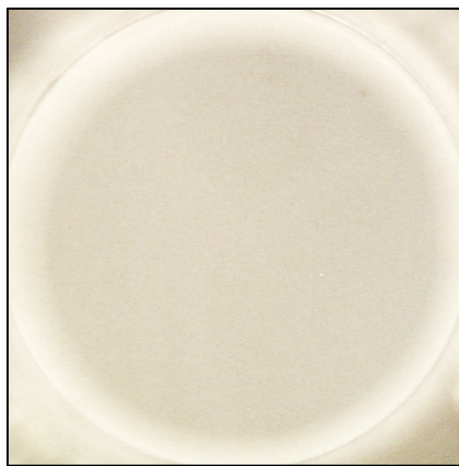
Stimulus: none ( 2 \times 10^5 cells/well)

Species reactivity rhesus macaque, cynomolgus monkey, pig-tailed macaque, Japanese macaque, crested black macaque, barbary macaque, lion-tailed macaque, baboon, mandrill, African green monkey, black mangabey, hanuman langur