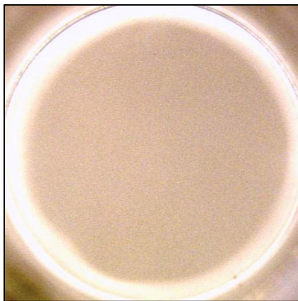
Stimulus: none ( 2 \times 10^5 cells/well)

Species reactivity: rhesus macaque, cynomolgus monkey, pig-tailed macaque, Japanese macaque, crested black macaque, lion-tailed macaque, baboon, mandrill, African green monkey, black mangabey, hanuman langur, marmoset