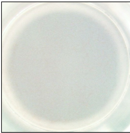
Stimulus: none ( 4 \times 10^5 cells/well)