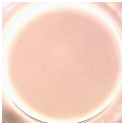
Stimulus: none ( 2 \times 10^5 cells/well)