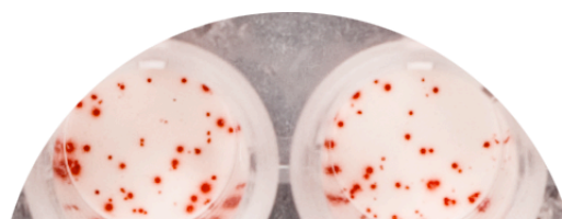
Enzymatic staining procedure on PVDF plates