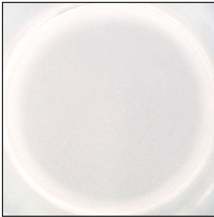
Stimulus: none ( 2 \times 10^5 cells/well)